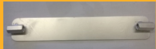
Band-plate before bending to pole profile